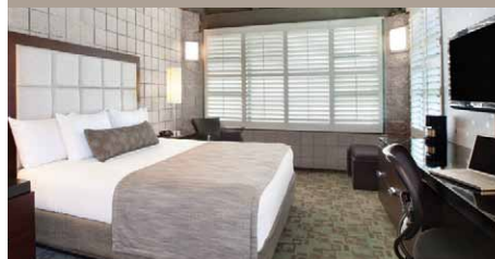
Enhanced Comfort and Service