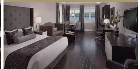
Distinct Style and Plush Amenities