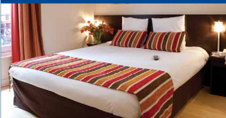
Restful Stay and Value